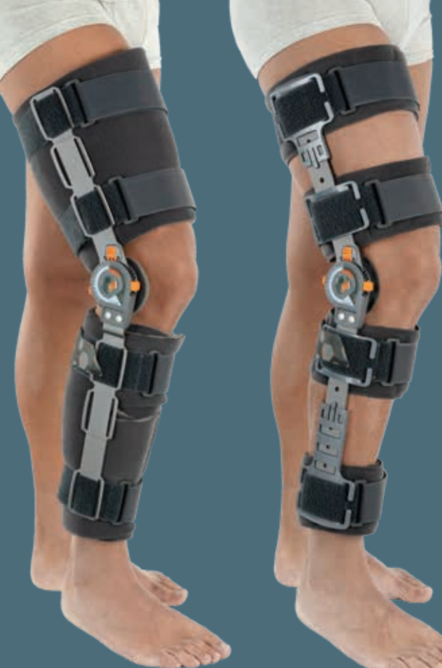
Go up BASIC

RO+TEN S.r.l. Sede legale: Via Marco De Marchi 7 · I-20121 Milano (MI) · Italia Sede operativa e amministrativa: Via Comasina 111 · I-20843 Verano Brianza (MB) · Italia Tel. 0039 039 601 40 94 · Fax 0039 039 601 42 34 info@roplusten.com · www.roplusten.com